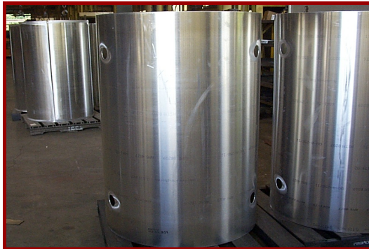
Precision rolled cylinders to +/- 1mm 300 Series SS & Aluminum 36" to 66" Dia. X 60" Long