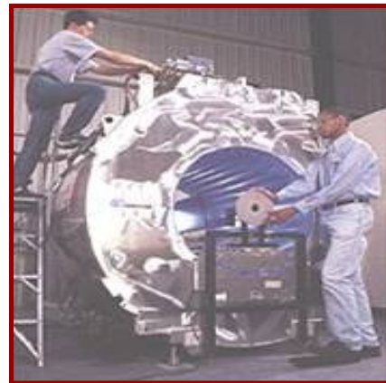
MRI Magnet Assembly