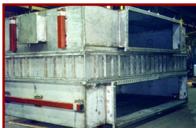
SCR Catalytic Structure